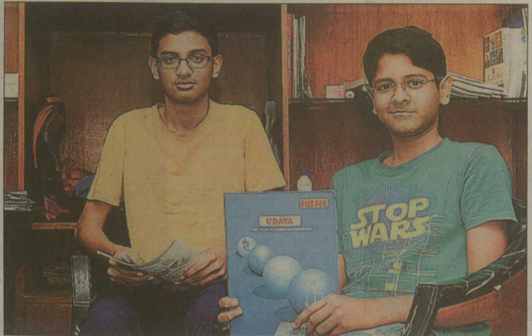
■ Counsellors warn that moulding children from a young age can limit their freedom of choice. FILE PHOTO

"When children are young they are more receptive and develop analytical reasoning. Early in life they are taught about